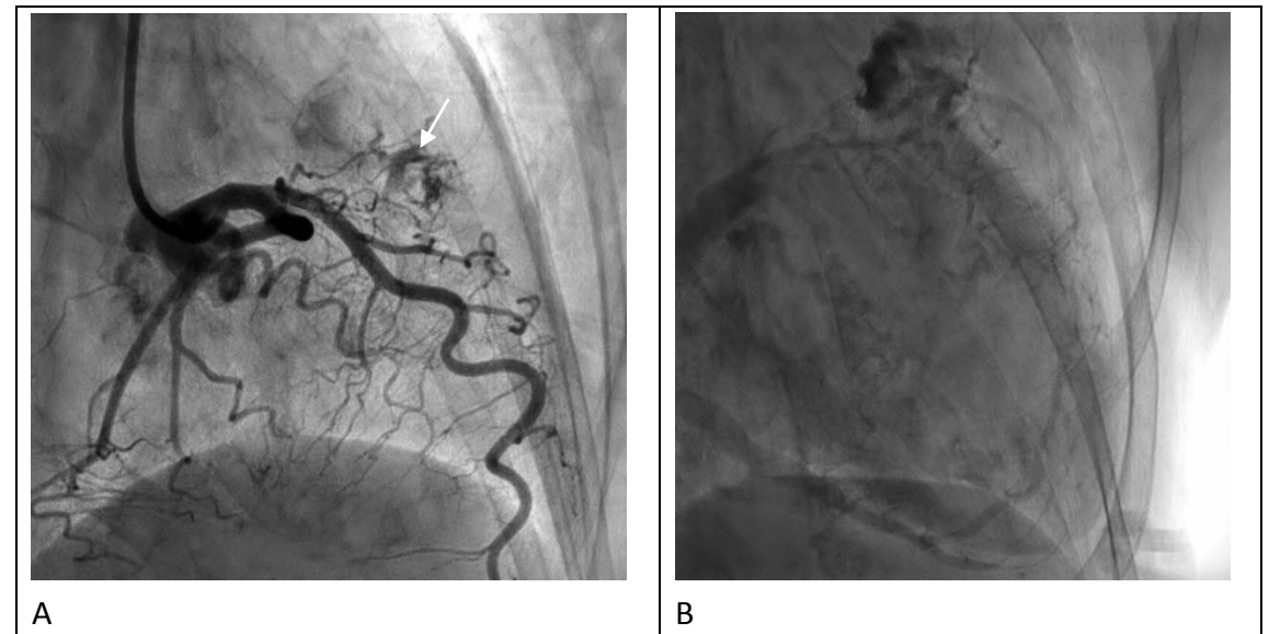
Figure 1 (A) Left coronary artery angiography revealed revealed neovascularization and fistula (white arrow) from atrial branch of left circumflex artery in right anterior oblique projection. (B) Stasis of contrast delineating the thrombus at left atrial appendage

involving the atrial branch and ramus branch of left circumflex artery emptying into left atrium (Figure 1A). Fluoroscopy also revealed LA appendage contrast stain in left atrium (Figure 1B). She undergone open mitral valve replacement later, and thrombi in left atrial appendage was found during surgery (Figure 3).