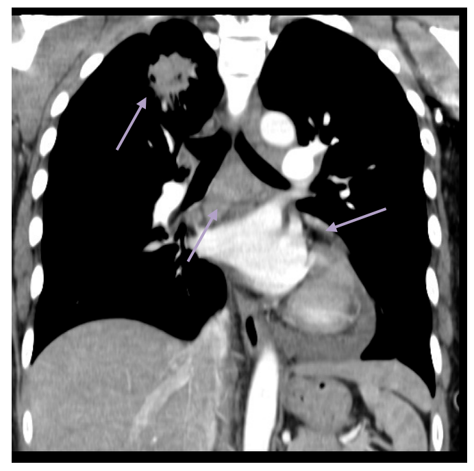
Figure 1. Chest computed tomography scans at initial presentation.