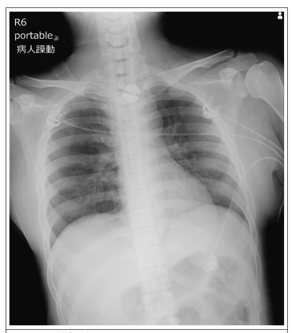
Figure 1. Patient's first chest X ray