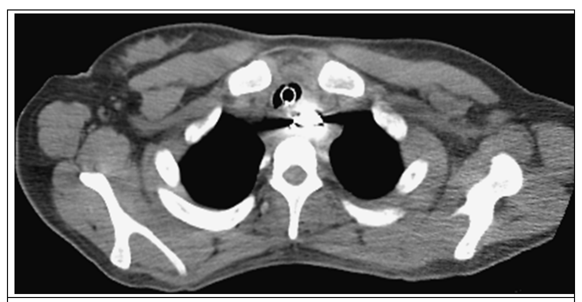
Figure 3. Radiopaque foreign body was found in esophagus