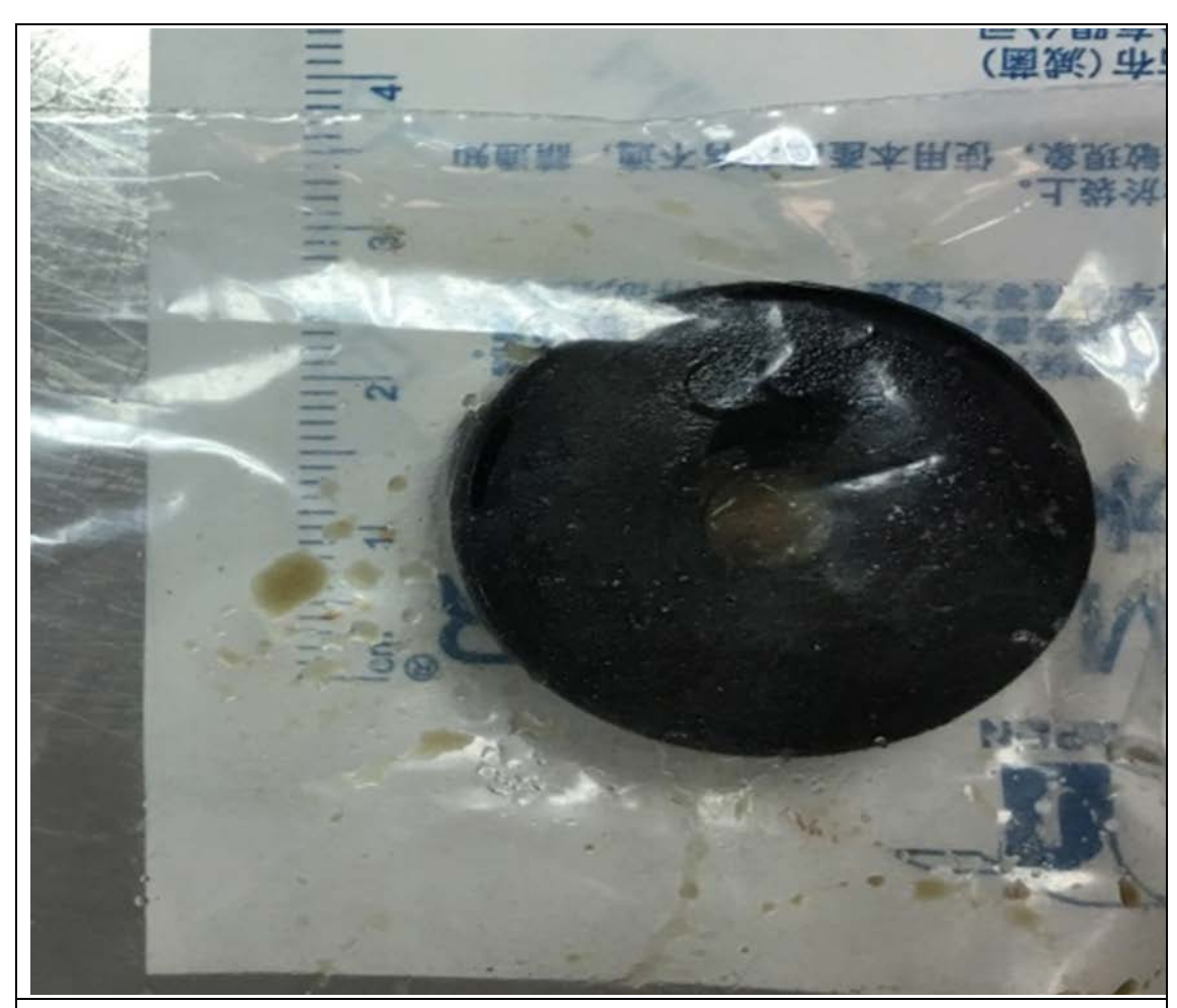
Figure 4. Foreign body was removed from esophagus by surgery.