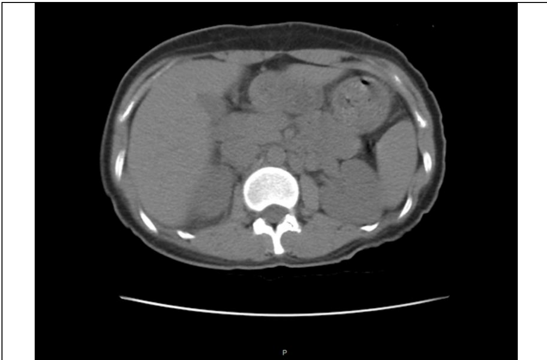
Figure 1. Abdominal CT prior to ceftriaxone treatment showing unremarkable gallbladder and bile ducts