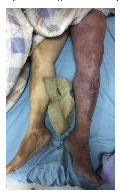
Figure 1: Left leg severe DVT complicated with acute compartment syndrome

In conclusion, there is high risk of amputation and even mortality for severe DVT complicated with acute compartment syndrome. Our case reminds physicians that combination of surgical decompression and EVT might be a good treatment strategy for these high risk patients.