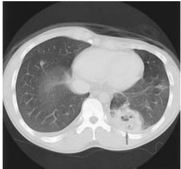
Fig.3.Chest CT showing the left lower lobe abscess formation due to septic embolism ( arrow ) in case 2.

ing of bilateral costophrenic angles ( Figure 2A ). Chest CT revealed multiple bilateral lung parenchymal lesions and a cavitating mass in the left lower lobe with a phenomenon of wall enhancement ( Figure 3 ). The Neck CT scan revealed a filling defect in the right internal jugular vein ( Figure 4 ). Color Doppler ultrasonography was performed on the tenth hospital day, revealing a spontaneous contrast echo