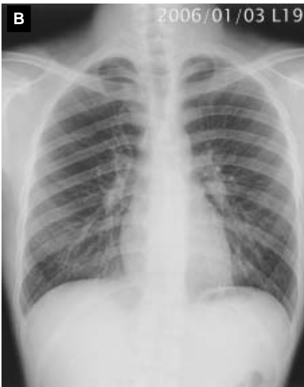
Fig.2A.PA view chest X-ray demonstrating increased density in the retrocardiac region ( arrow ) and bilateral costophrenic angle blunting in case 2.