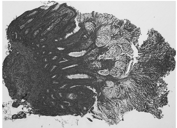
Fig.2.A characteristic volcano lesion may be seen in which crypts erupt as mucus and neutrophils stream from destroyed gland. Surrounding crypts may appear normal. (H&E, 40X)