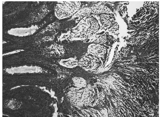
Fig.3.Small pseudomembrane is composed of fibrin, inflammatory debris with superficial necrosis in underlying mucosa. (H&E, 100X)