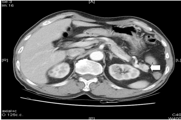
Fig.1. Abdominal CT scan. It showed a hypervascular nodule about 1 cm over pancreatic tail during arterial phase (arrow head).

poglycemia or supervised 72-h fasting test 1 . Occasionally, islet cell tumor may be presented with episodes of hypoglycemia without hyperinsulinemia