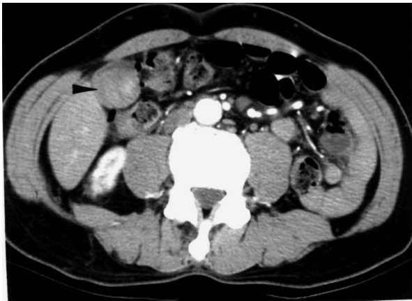
Fig.2 Computed tomography showing a non-enhanced tumor-like lesion (arrowhead) in the gallbladder after contrast enhancement.

was 158.5 seconds (control 12.5 seconds), and the INR was 13.29. After stopping warfarin, PT returned to 13.5 seconds (control 13 seconds) one week before this ultrasonography. He had no specific symptom or sign related to bleeding tendency during this period. He had no petechia or ecchymoses in appearance. He had no abdominal pain or tenderness. No jaundice or anemia was seen. The blood cell counts and biochemistry tests were within normal limits. The CEA level was under normal limit. He underwent abdominal computed tomography, a high-attenuated gallbladder tumor without enhancement was noted (Fig. 2). Because gallbladder neoplasm could not be excluded,