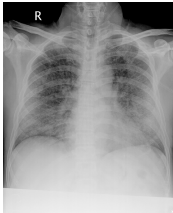
Figure 2. Chest radiograph showed generalized interstitial infiltrations in both lungs within the 48 hours after admission.